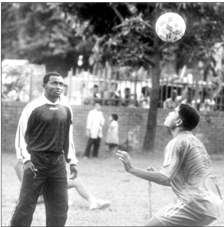
TITANIC TRAINING! Rivals Abahani (L) and Mohammedan players during their practice sessions yesterday. An Abahani booter practise heading at their club ground in Dhanmondi while Mohammedan's five Cameroon recruits have a talk at their club premises before heading for their session.