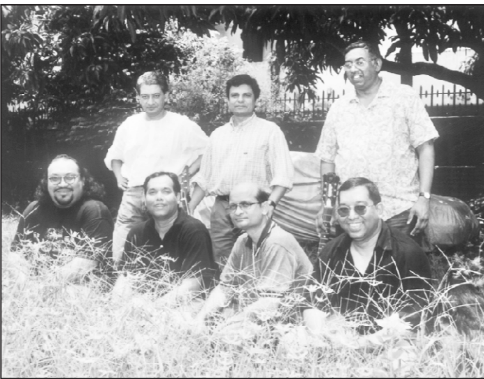
The 21st century Renaissance

They compose melody based songs with more of a 'jibon-mukhi'-theme to pass a message through their creation.