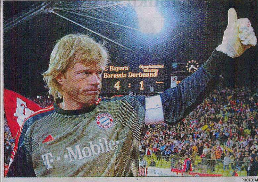
Bayern Munich captain and custodian Oliver Kahn gives the thumbs-up after defeating Borussia Dortmund 4-1 at Munich's Olympic stadium on November 9.