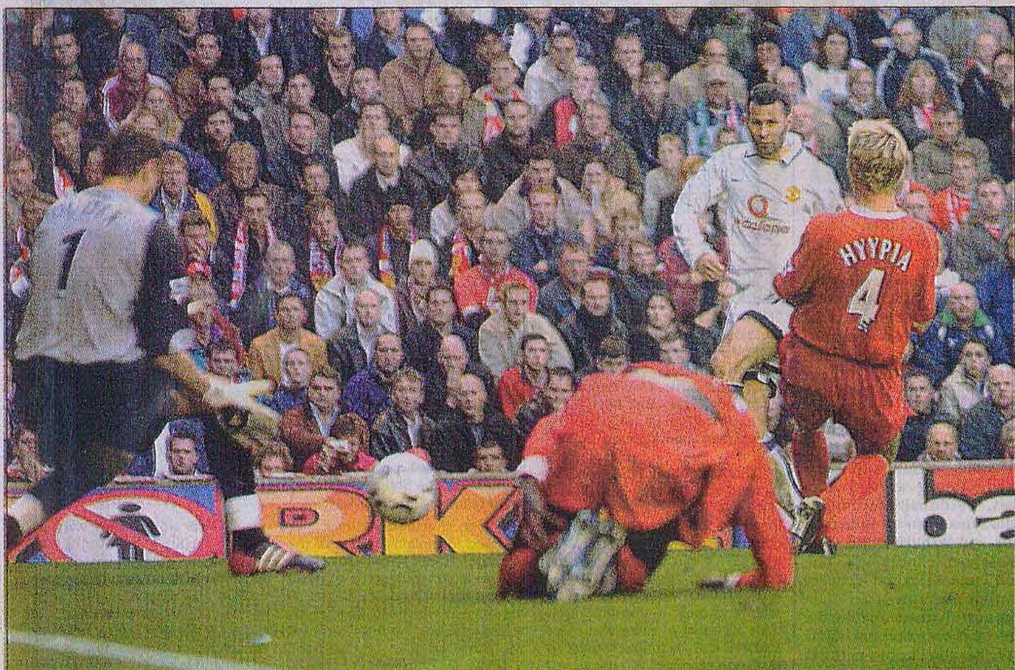
THAT'LL DO IT! Manchester United winger Ryan Giggs (2nd from R) drills in his second goal against Liverpool at Anfield on November 9.