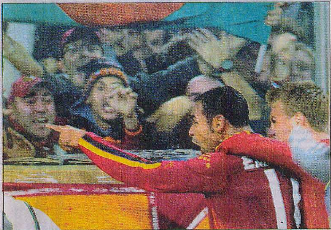
DIDN'T I TELL YOU? AS Roma's Brazilian international Emerson (L) is over the moon after scoring the second goal against Lazio at the Olympic Stadium in Rome on November 9.