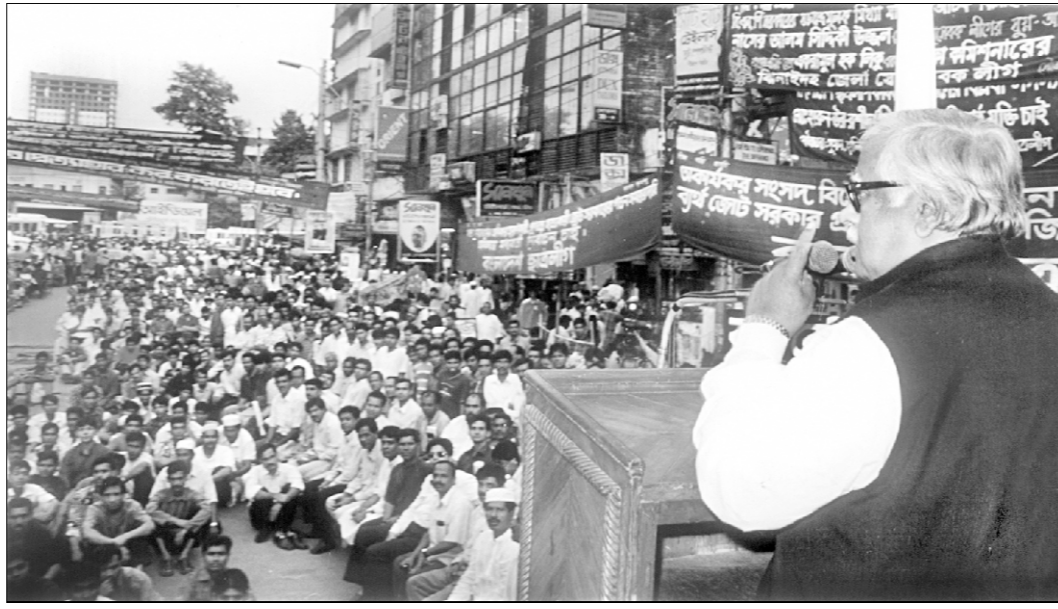
Awami League General Secretary Abdul Jalil addresses a rally at Bangabandhu Avenue in the city yesterday. Awami Jubo League organised the rally in observance of the Noor Hossain Day.

They held an hour-long discussion on matters of mutual interest of the two countries.