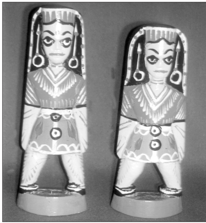
Sonargaon village doll, hewn from a single piece of wood

marketing for general genre of handicrafts. As time is passing and we're realising that the commercialisation of our products is going from bad to worse so that, it is overpowering our original purity of design. For this reason this project has been undertaken and in this we have presented a large range of authentic rural crafts."