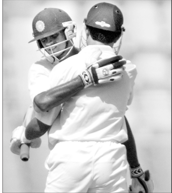
Double centurion Rahul Dravid (L) gets a congratulatory hug from captain Sourav Ganguly, who also scored a hundred, on the second day of the first Test yesterday.