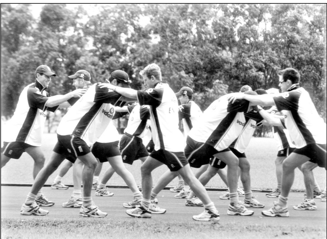
LET'S FIGHT! The England team stretch during a training session at the Bangladesh Krira Shikkha Protisthan (BKSP) yesterday.