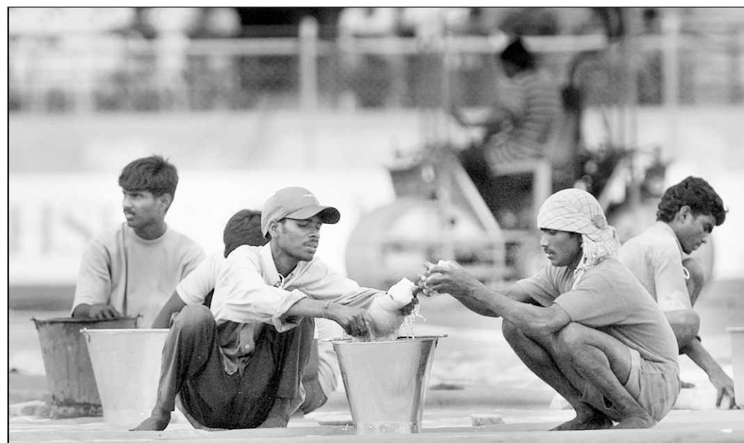
Groundsmen use sponge to wipe off rainwater from on top of the pitch-cover at Visakhapatnam on the opening day of a three-day match between New Zealand and Indian Board President's XI yesterday.

"I believe that punctuality is the first criteria for a good umpire. The other important thing is how an official controls the match," Francis said in his inaugural speech,