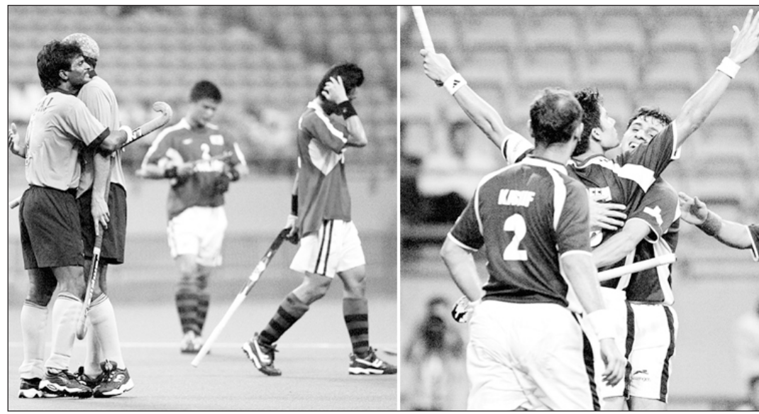
(L) Indian captain Dhanraj Pillay (L) gives teammate Prabhjot Singh a congratulatory hug as dejected South Korean players leave the field yesterday. India knocked out the defending champions from the Sixth Men's Asia Cup hockey tournament. (R) Pakistani players celebrate after scoring their third goal against Japan in the other semifinal.