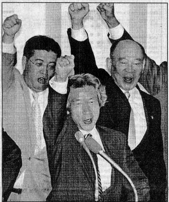
Accompanied by fellow parliament members, Japanese Prime Minister Junichiro Koizumi (C) raises his fist as he yells out after winning re-election as president of the ruling Liberal Democratic Party (LDP) at the LDP's headquarters in Tokyo yesterday. Koizumi easily reelected as president of the ruling LDP, virtually ensuring the nation's premiership.