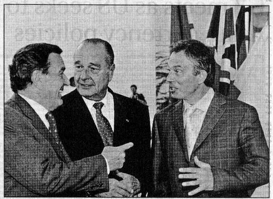
German Chancellor Gerhard Schroeder (L) greets French President Jacques Chirac (C) and British Prime Minister Tony Blair upon their arrival yesterday in the courtyard of the chancellery in Berlin, before a working lunch. The three leaders held talks aimed at finding common ground on stabilising troubled Iraq and healing Europe's diplomatic wounds over the US-led war.

Britain, the United States' staunchest ally in prosecuting the war, shares the US view that a transfer should not be rushed.