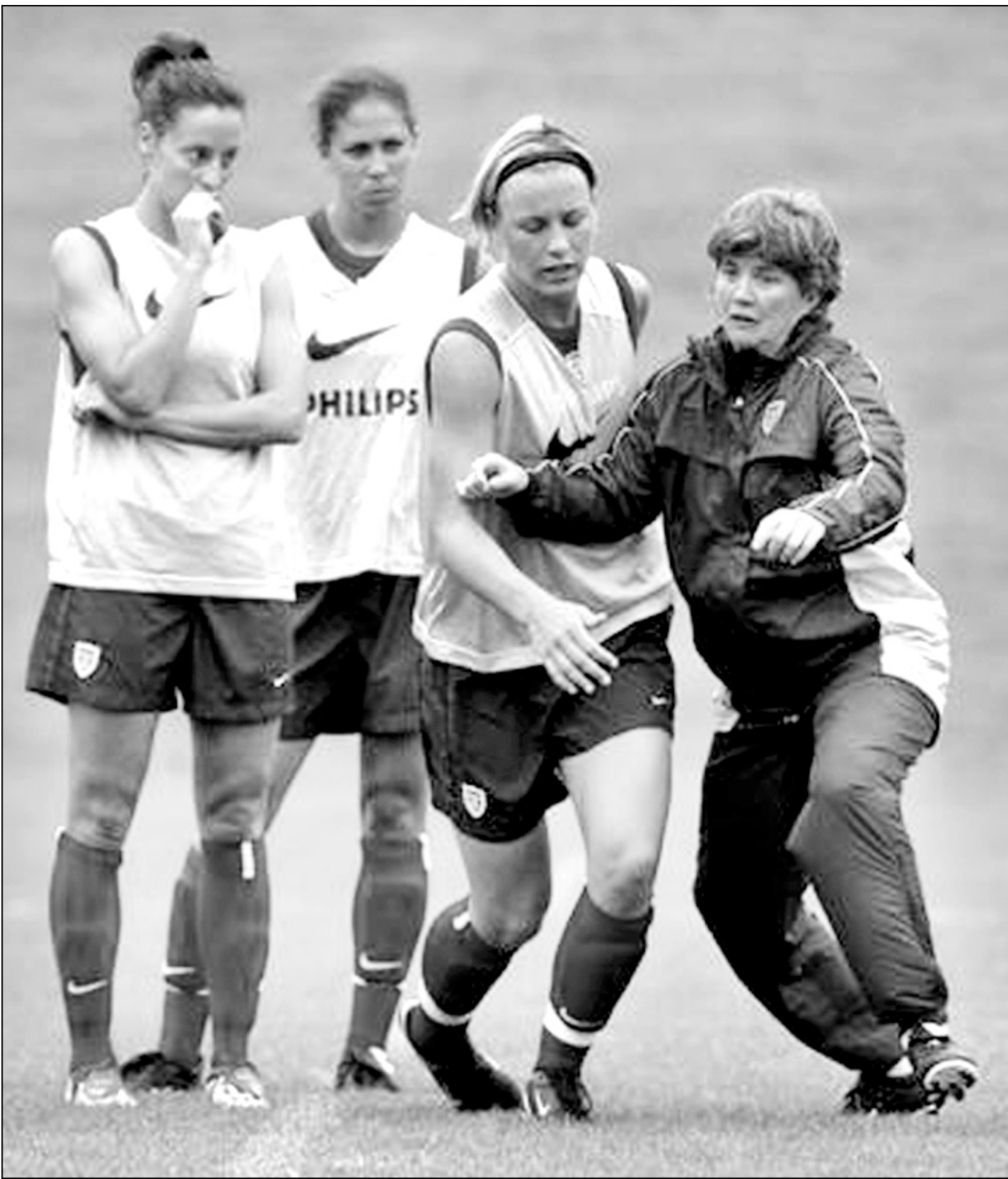
USA head coach April Heinrichs (R) blocks Abby Wambach (C) while showing a drill during a practice session in Washington, D.C. on September 18. Behind Wambach are Kate Sobrero (L) and Shannon Boxx.