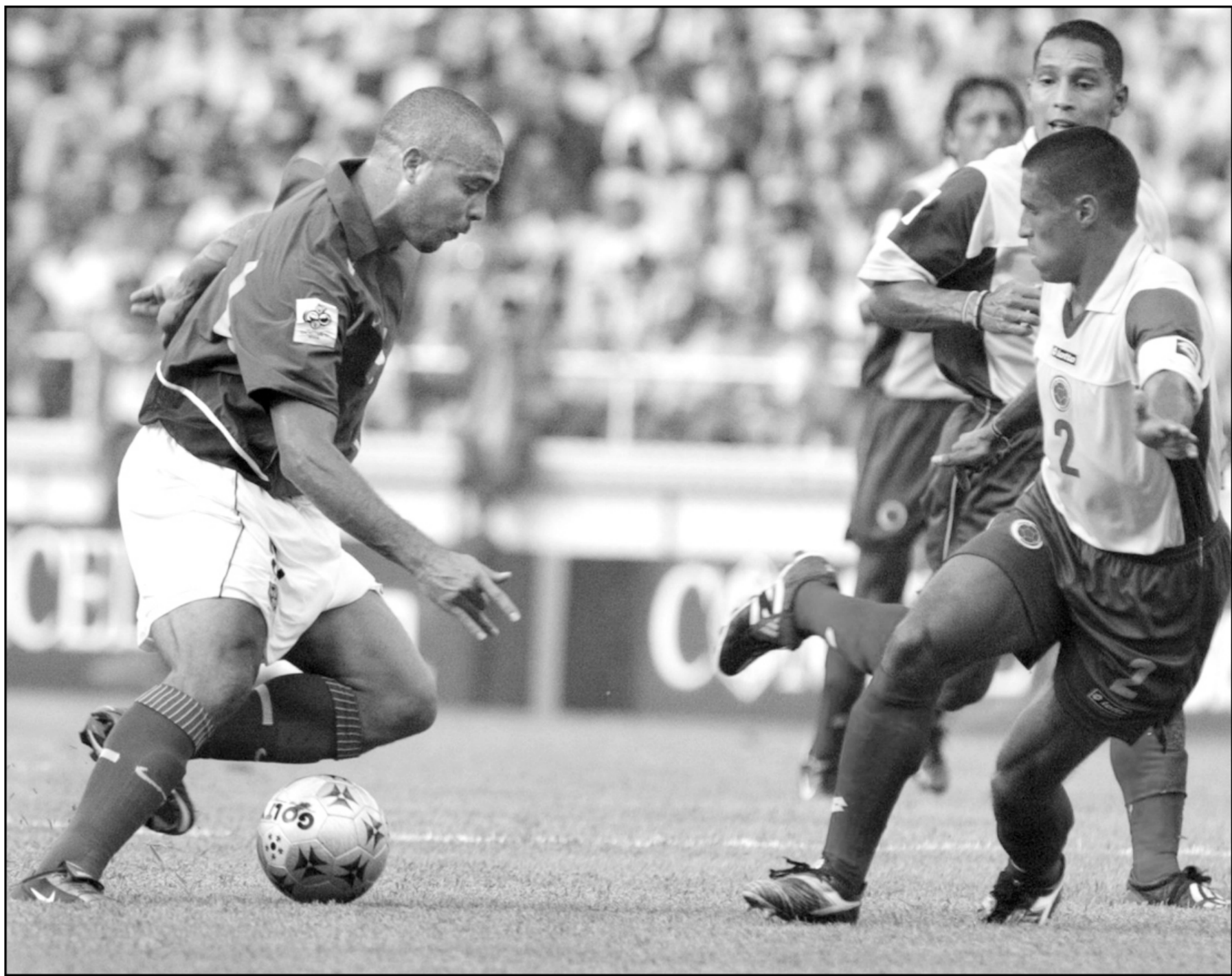
TURNING IT ON: Brazil superstar Ronaldo (L) trying to outfox Colombian defender Ivan Ramiro Cordoba at Barranquilla, Colombia on September 7.

Brazil are at home to Ecuador on Wednesday in the second match of a marathon 18-game campaign that will finish in November 2005. Colombia are away to Bolivia on the same day.