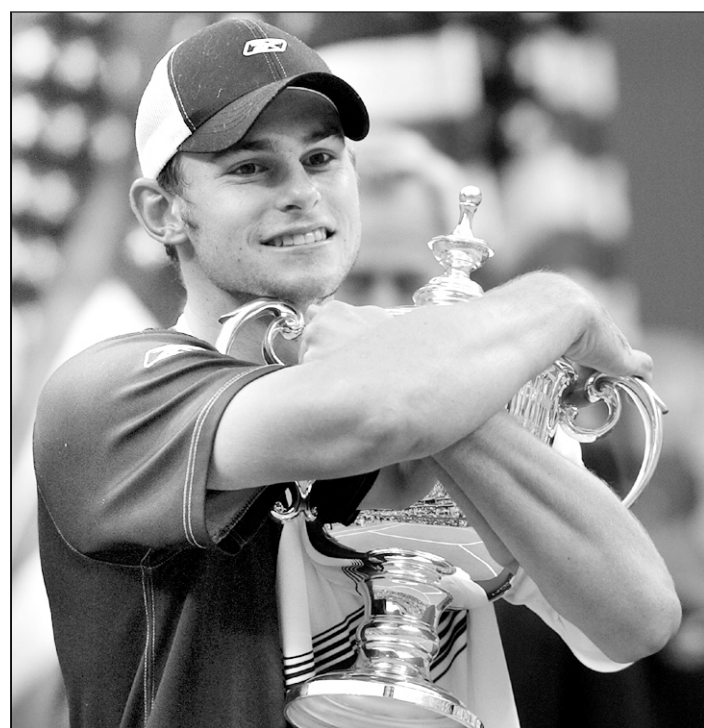
IT BELONGS TO ME: The new US Open champion Andy Roddick.