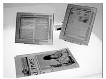
The gadget could hold books or newspapers

BBC ONLINE A new gadget could spell an end to books as we know them. Researchers at Hewlett Packard have developed a prototype electronic book, which can hold a whole library on a device no bigger than a paperback. The brushed metal device is about one centimetre thick and looks like an oversized handheld computer.