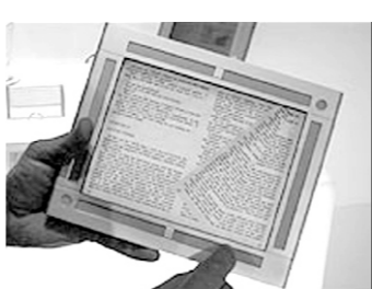
You can turn pages with the flick of a finger