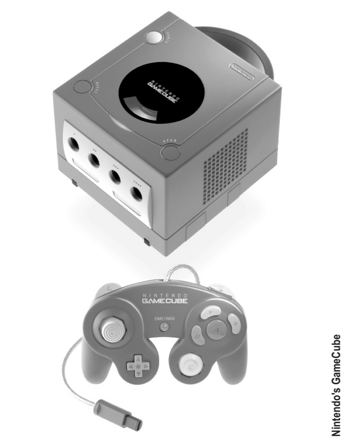
SYED TASHFİN CHOWDHURY

THE eruption of gaming consoles in the market has pitched gamers in Bangladesh and elsewhere in the globe into the delightful dilemma as to which one to refer to as the ultimate gaming device--PlayStation 2? Or is it Nintendo GameCube (GC) or the X-Box by Microsoft? The 128 bit PlayStation 2 continues to build upon the legacy of the PlayStation and PlayStation 1 by taking gaming to heights which are merely unbelievable. At its heart is Sony's unique 300 MHz CPU -- the Emotion Engine -- that delivers amazing graphics and stunning sound effects that