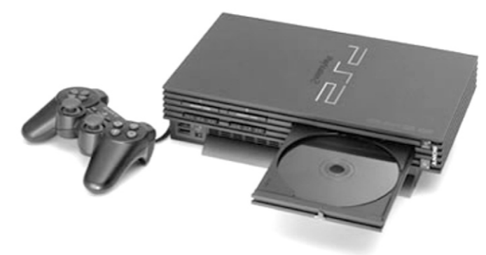
Sony's Play Station 2

range of GameCube games available, but the ones that are available are of high quality. Most of these games are conversions from existing X-Box or PS2 titles. With all the specifications, it is supposed to be a lot tougher for anyone to decide which is the best gaming console at the moment. The gamers of our country prefer Playstation 2 over its two competitors. "The games of