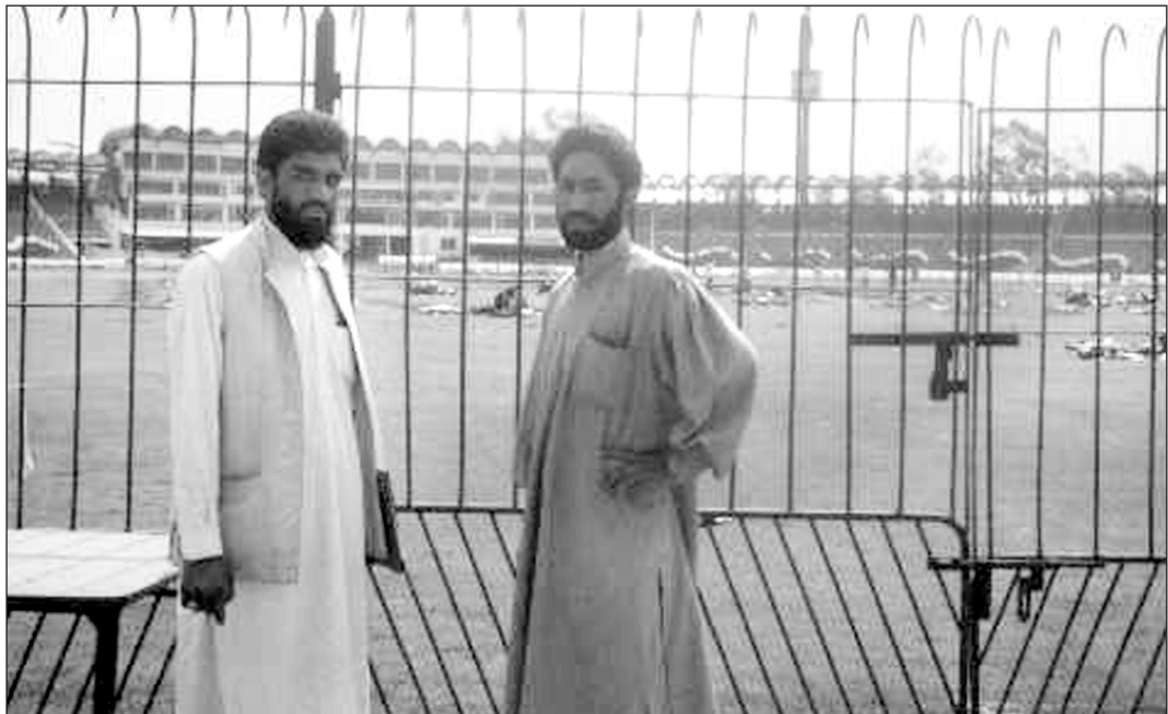
A file photo showing two local fans standing inside the grilled fencing of the Arbab Niaz Stadium in Peshwar where the second Super Asia Test between Bangladesh and Pakistan will be held.