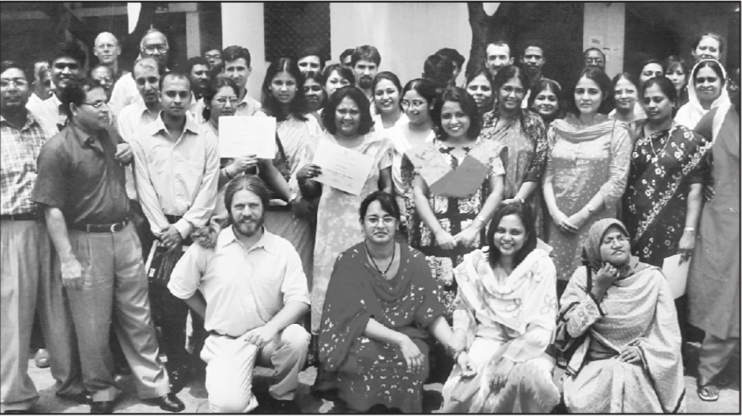
Participants of the ICT workshop at the Aga Khan School, Dhaka.