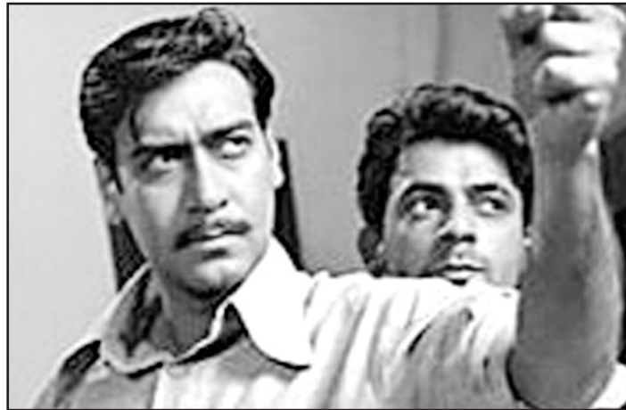
Devgan in the role of Bhagat Singh

The award-winning performance in the period film must have come as doubly sweeter for Devgan for when it was released in commercial circuit in India last year, it was in race with four other films which were also released almost at the same time on the same personality.