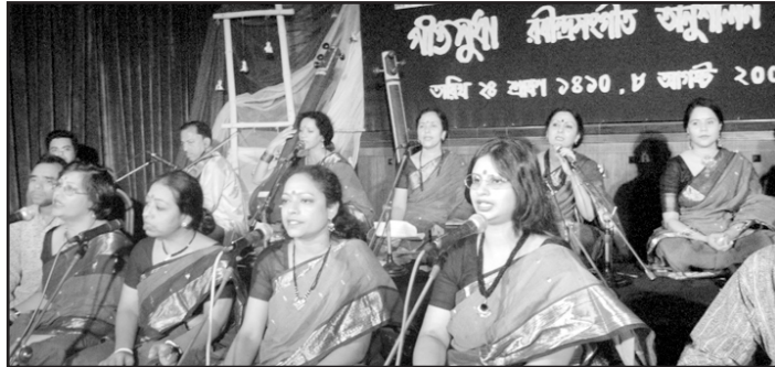
Singers of Geetshudha rendering songs.