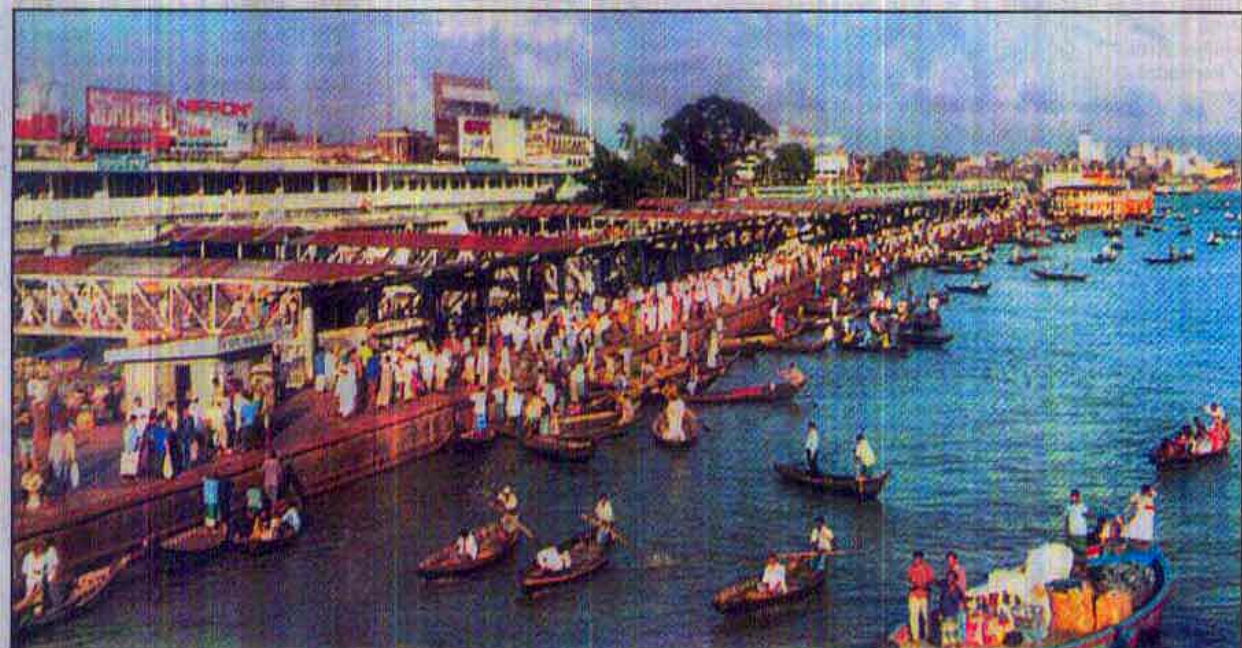
The busy Sadarghat launch terminal lies derelict after launch owners yesterday enforced an indefinite strike demanding resignation of the shipping minister.