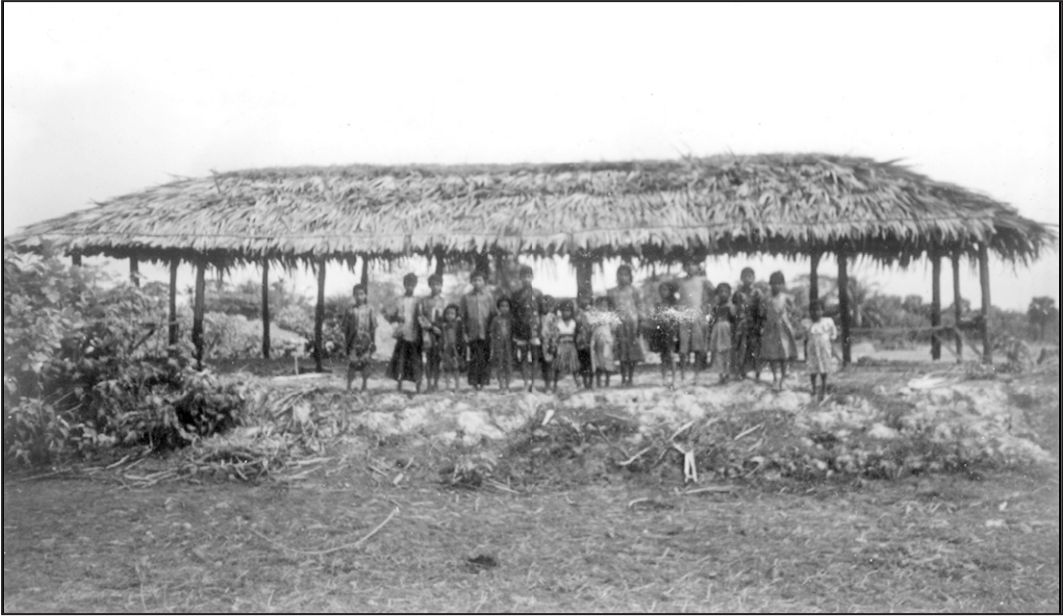
This is government registered Madda Dhankhali Primary School in Kalapara upazila in Patuakhali. The photo was taken during school hours recently. Is the area not covered under the government's 'education for all' programme?