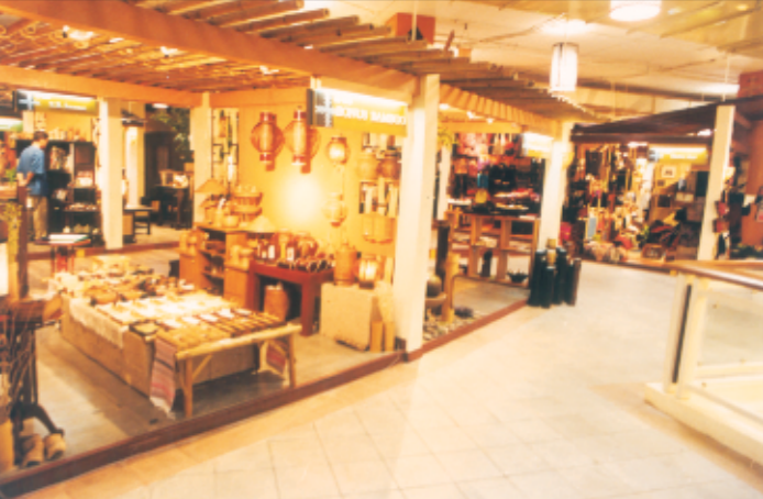
Chiang Mai night bazaar