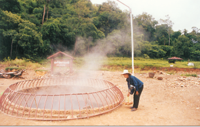
The Hot Spa -- you can get your eggs boiled here