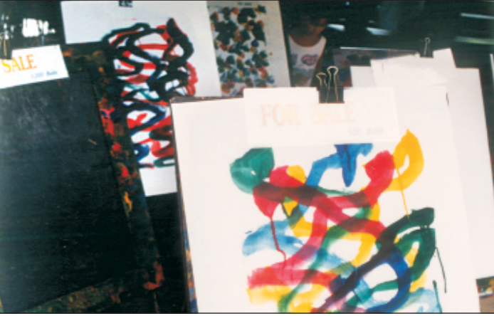
Paintings drawn by elephants at Mesai Elephant Camp