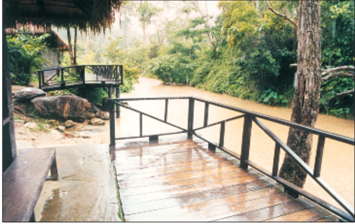
A rapid flowing through Mesai