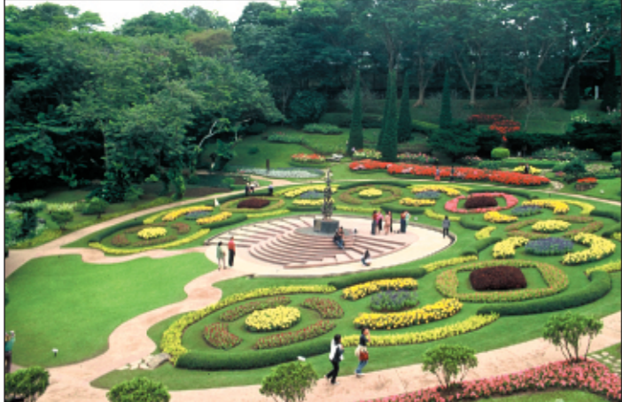
Doi Tung garden