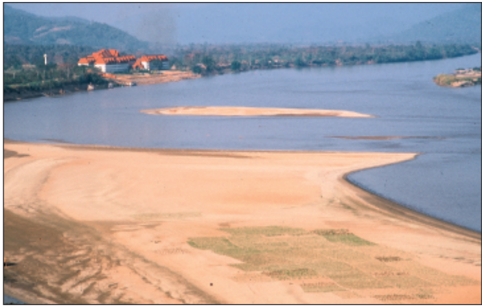
The Golden Triangle with the casino seen in Myanmar side