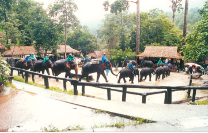
Elephants queue up for entertainment