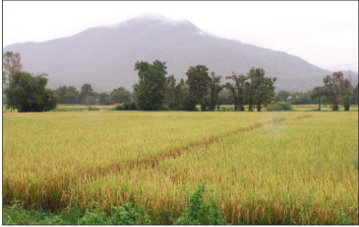
Sleeping Lady mountain