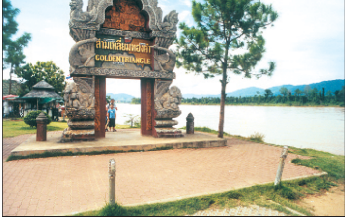
The Golden Triangle