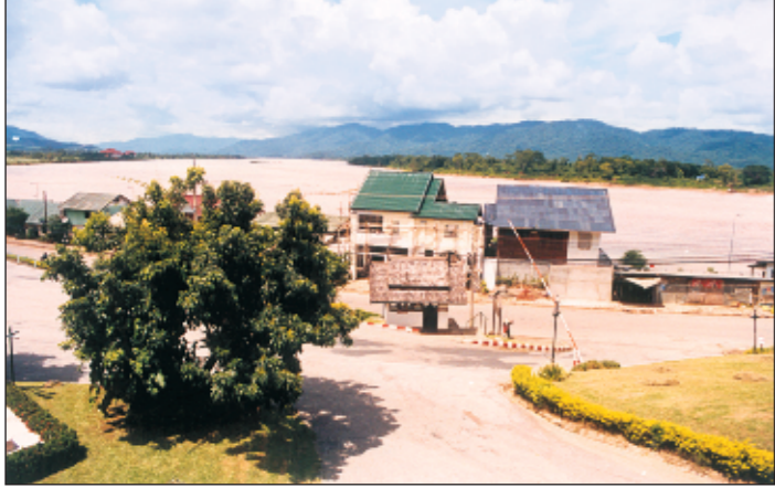
The Golden Triangle