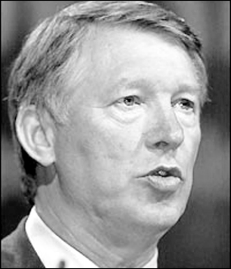
SIR ALEX FERGUSON

"We only arrived on Monday evening and some of the lads were waking up at 3am because of the jet lag. The heat was unbelievable as well and that showed in our performance."