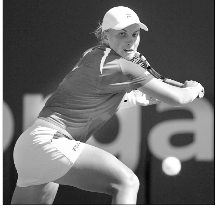
Russian Svetlana Kuznetsova hits a backhand to Jelena Dokic of Yugoslavia during their Los Angeles Open match on August 6.

Other seeded players to advance Wednesday included South Africa's Amanda Coetzer, Meghann Shaughnessy of the US, and Francesca Schiavone of Italy.