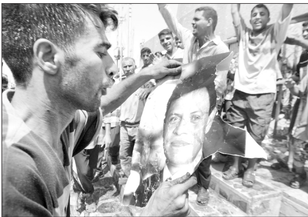
An Iraqi spits on a portrait of Jordanian King Abdullah, taken from inside the Jordanian embassy in Baghdad, where a car bomb killed at least nine people yesterday. Dozens of angry Iraqis stormed the embassy after the blast and tore apart the Jordanian flag while burning pictures of King Abdullah and his father, the late King Hussein.

Russian President Vladimir Putin is expected to speak before the UN General Assembly next month, with his address most likely to touch most heavily on Iraq.