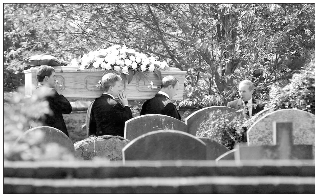
Pallbearers carry the coffin of Government weapons expert Dr David Kelly at St Mary's Church in Longworth, Oxfordshire on Wednesday. Around 160 mourners including Deputy Prime Minister John Prescott and Lord Hutton, who is leading the inquiry into Dr Kelly's apparent suicide, took part in it.

"Iran has openly announced that nuclear weapons have no place in its military and security doctrine and we basically believe that obtaining weapons of mass destruction is immoral, inhuman and against religious beliefs," he added.