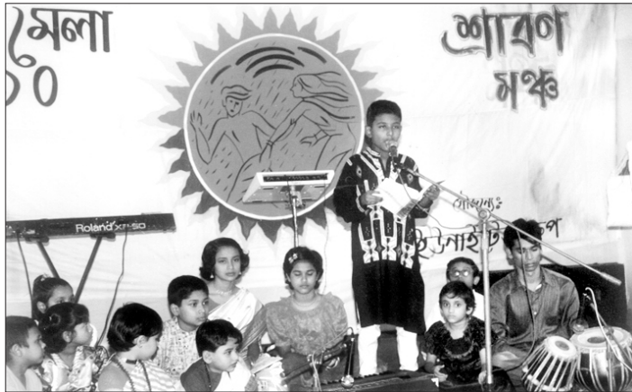
Children performed poetry recitation at the Sraban Mela organised by the local youths of Gopibagh in the city.

Apart from the cultural shows, a few stalls displayed folk art-works and earthenware in the fair. The whole Third Lane, where the celebration fair took place, had become an inspiring gathering of people who are culturally enlightened and truly Bangali at heart.