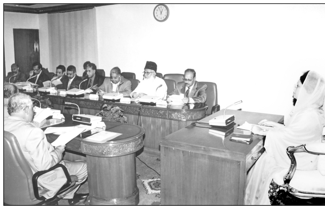
Prime Minister Khaleda Zia presides over a meeting at her office yesterday to review the progress of activities of different ministries and departments.

Police could not arrest any one in this connection till the writing of this report yesterday evening.