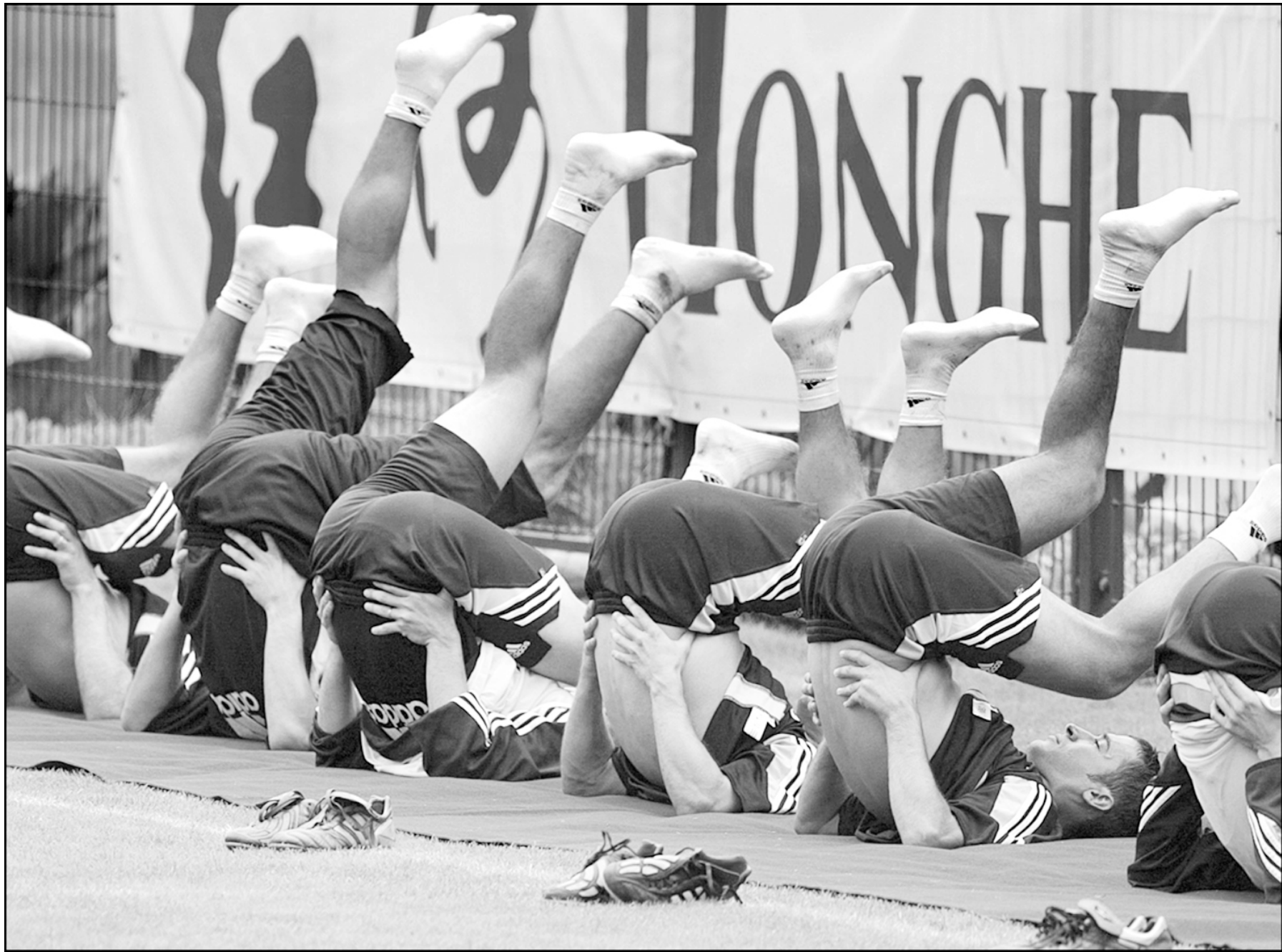
UPSIDE DOWN! Real Madrid players stretch during practice at the Hongta sports centre in China's south-western city of Kunming yesterday. The nine-time European champions will end their training camp in the city on July 31 and then face a Chinese XI on August 2 in Beijing before departing for Hong Kong, Tokyo and Bangkok.