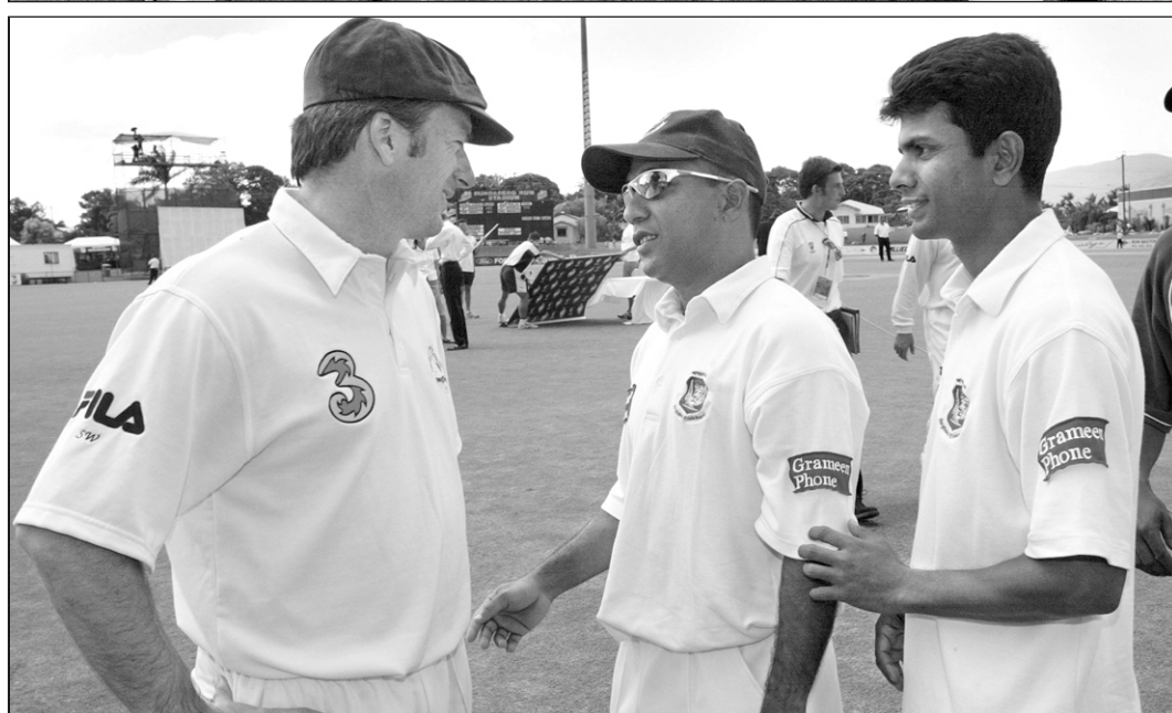
(Top) THEIR HUNGER FOR SUCCESS NEVER CEASES: The jubilant Australian team poses after their series win against Bangladesh at Cairns yesterday. (Below) WE MADE YOU SWEAT, DIDN'T WE? Bangladesh captain Khaled Mahmud (C) and all-rounder Sanwar Hossain talk to Australian skipper Steve Waugh after the end of the second Test.