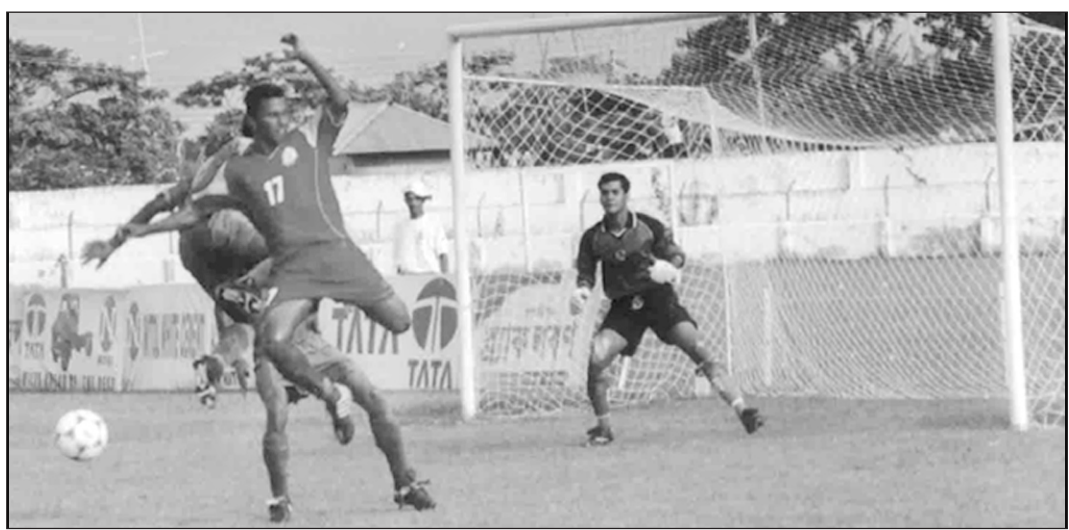
Action from yesterday's National Football League clash between Muktiyoddha Sangsad Krira Chakra and Dhaka Abahani at the Barisal Stadium.