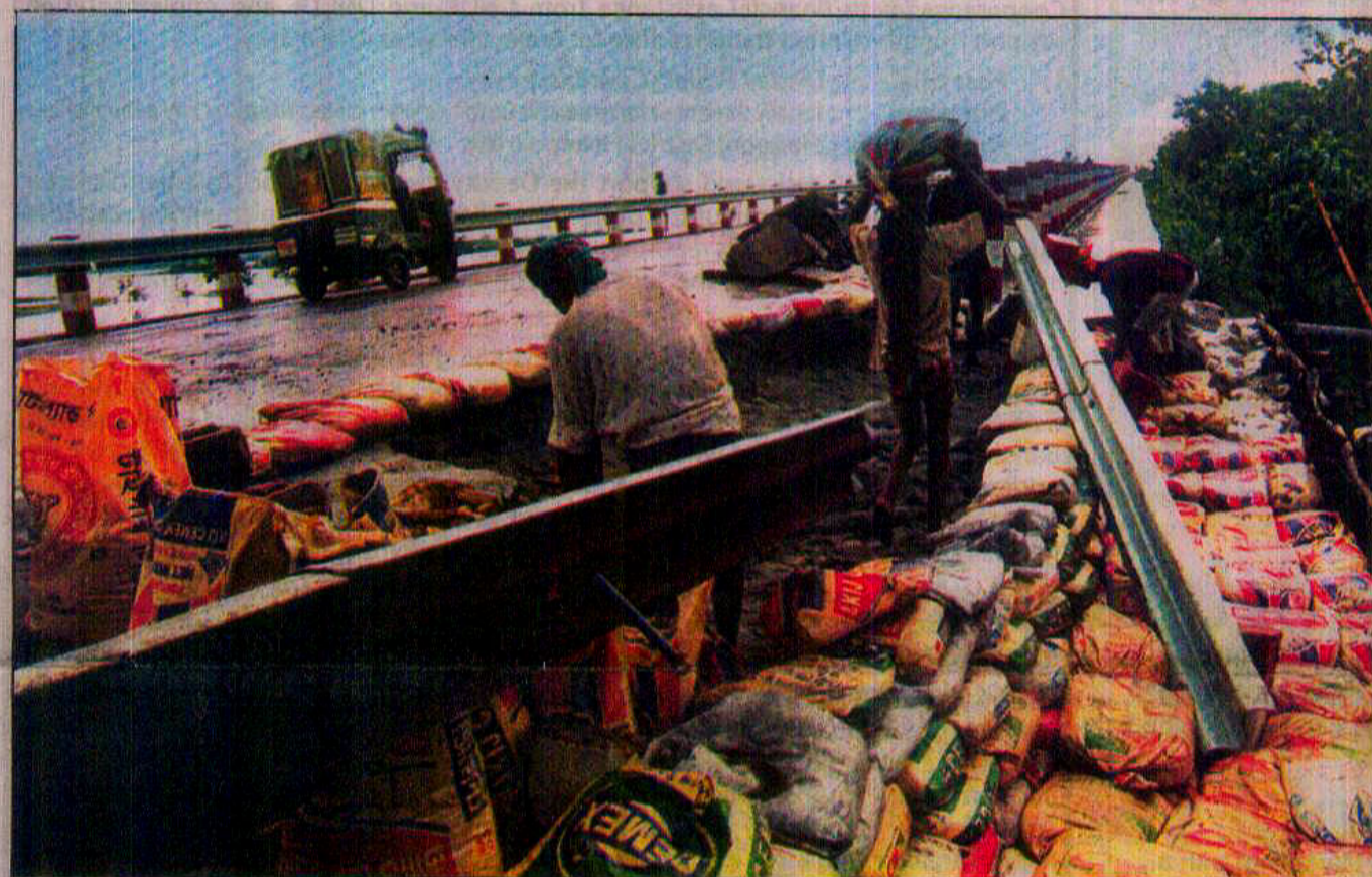
Workers place sandbags at an end of the first bridge on the Dhaleshwari River to save it from further erosion. The bridge is an important link between Dhaka and the southern region.