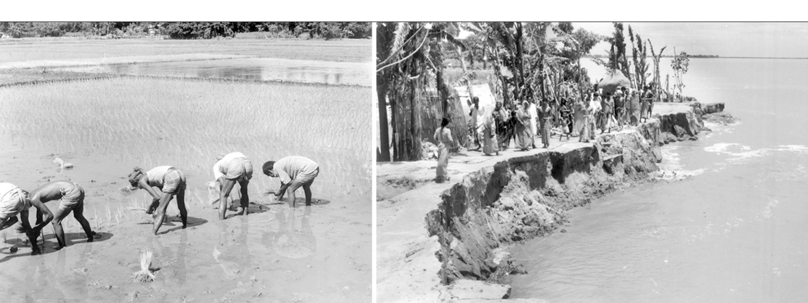
A boon for some and bane for others.. as floodwater recedes, farmers in Shovaganj area under Sundarganj upazila transplant aman seedlings on lands enriched with fertile alluvial deposit (left), while erosion by the Brahmaputra has intensified at Karibari in the Sadar upazila (right) in Gaibandha district. The photos were taken on Saturday.