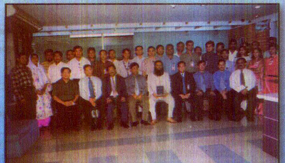
Directors of NASSA GROUP with WAL*MART (Dhaka) Associates