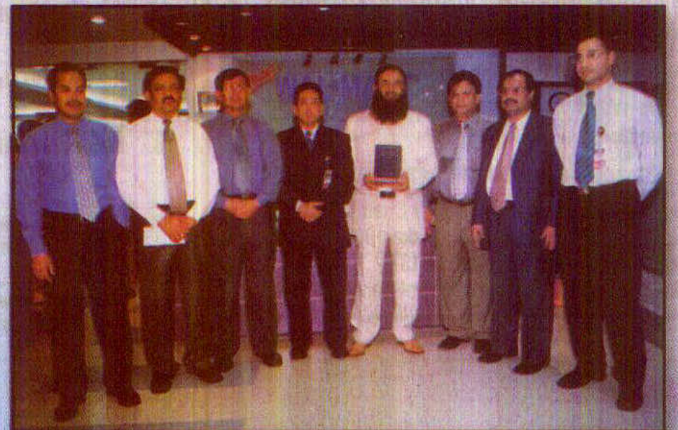
Directors of NASSA GROUP and WAL*MART (Dhaka) High Officials.