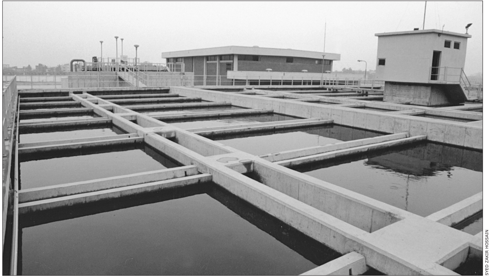
The Saidabad Water Treatment Plant (1st Phase) was completed in July 2002, but is not sufficient to meet the city's demands.

Once implemented, the phase-2 project will add 22.5 litres of water to the WASA's pipeline. The central part of the city old Dhaka, Shantinagar, Motijheel, Elephant Road, Tejgaon, part of Dhanmondi and Lalmatia will immensely be benefited from this plant.