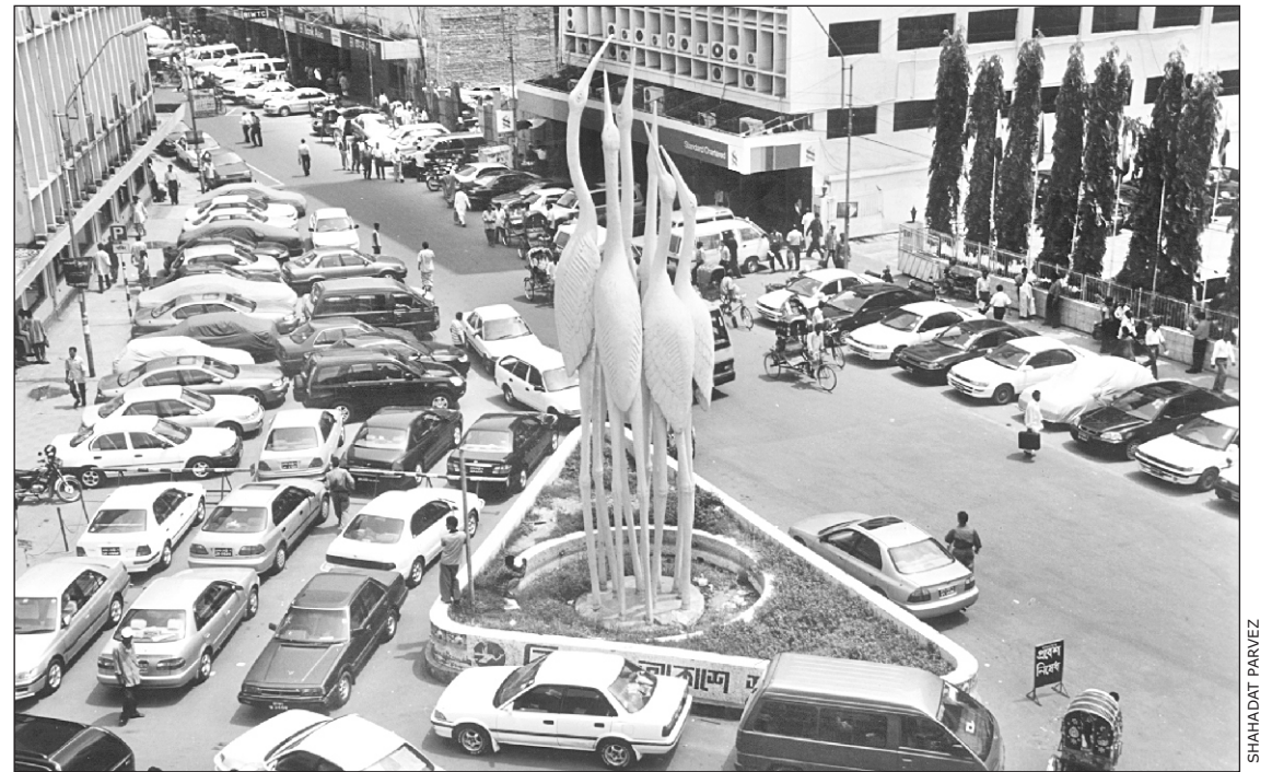
Motijheel's parking problems continue as multi-storey car-parking projects suffer setbacks.

(*three bighas = approximately one acre)