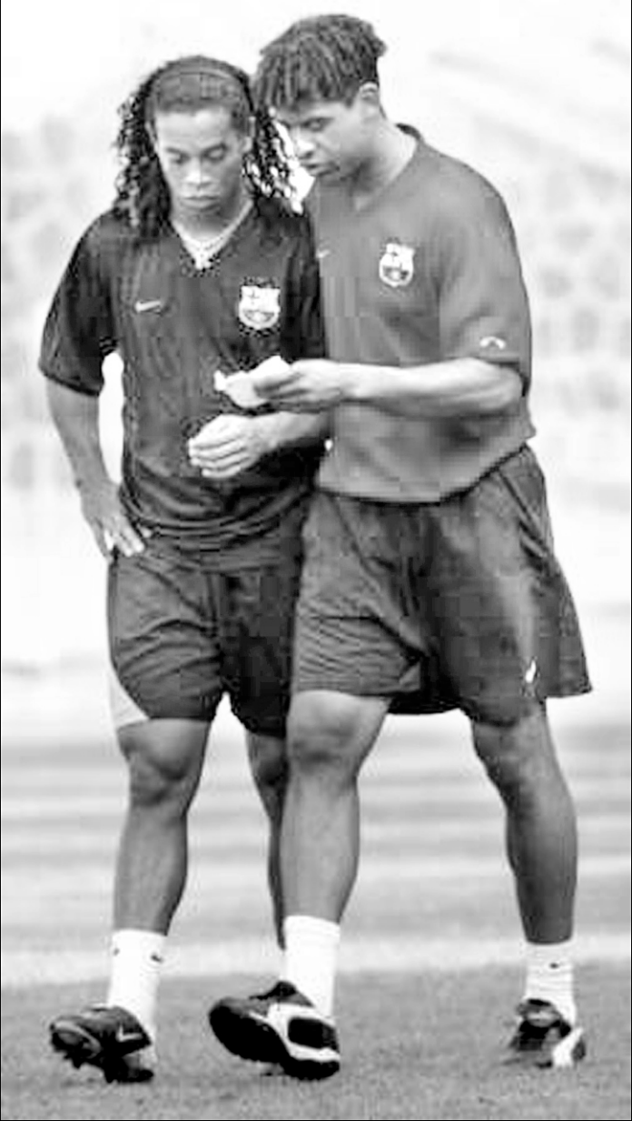
Barcelona manager Frank Rijkaard tells superstar Ronaldinho something during the Brazilian's first training session at Barcelona on July 22.

Real are looking to arrange a warm-up against Espanyol on August 17 - which if it goes ahead would be Beckham's debut on Spanish soil. The match and venue are yet to be confirmed.