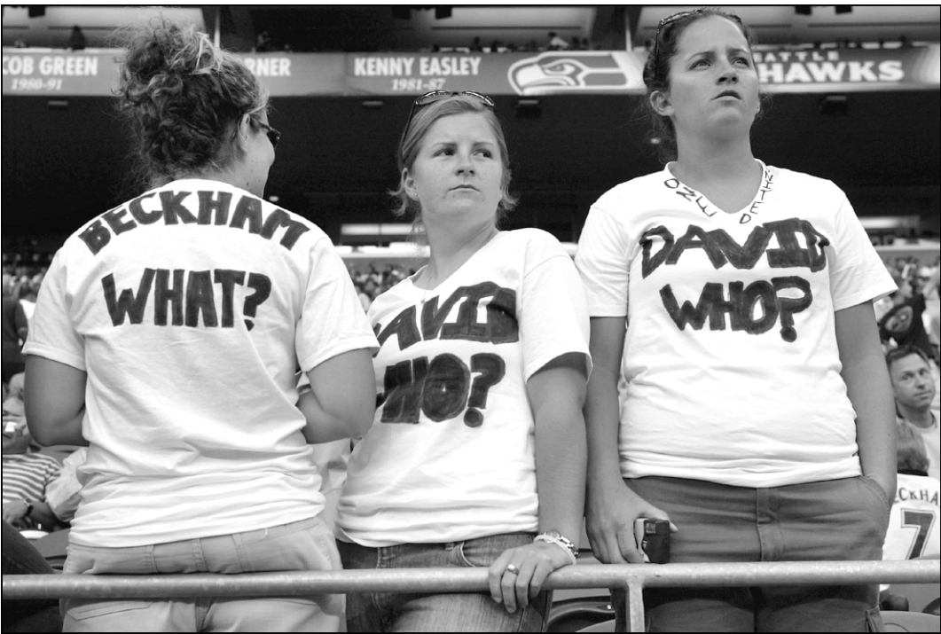
COULDN'T CARE LESS? Fans of Manchester United express their aparent disinterest in the loss of David Beckham to Real Madrid before the Red Devils' friendly match against Glasgow Celtic on July 22 July.