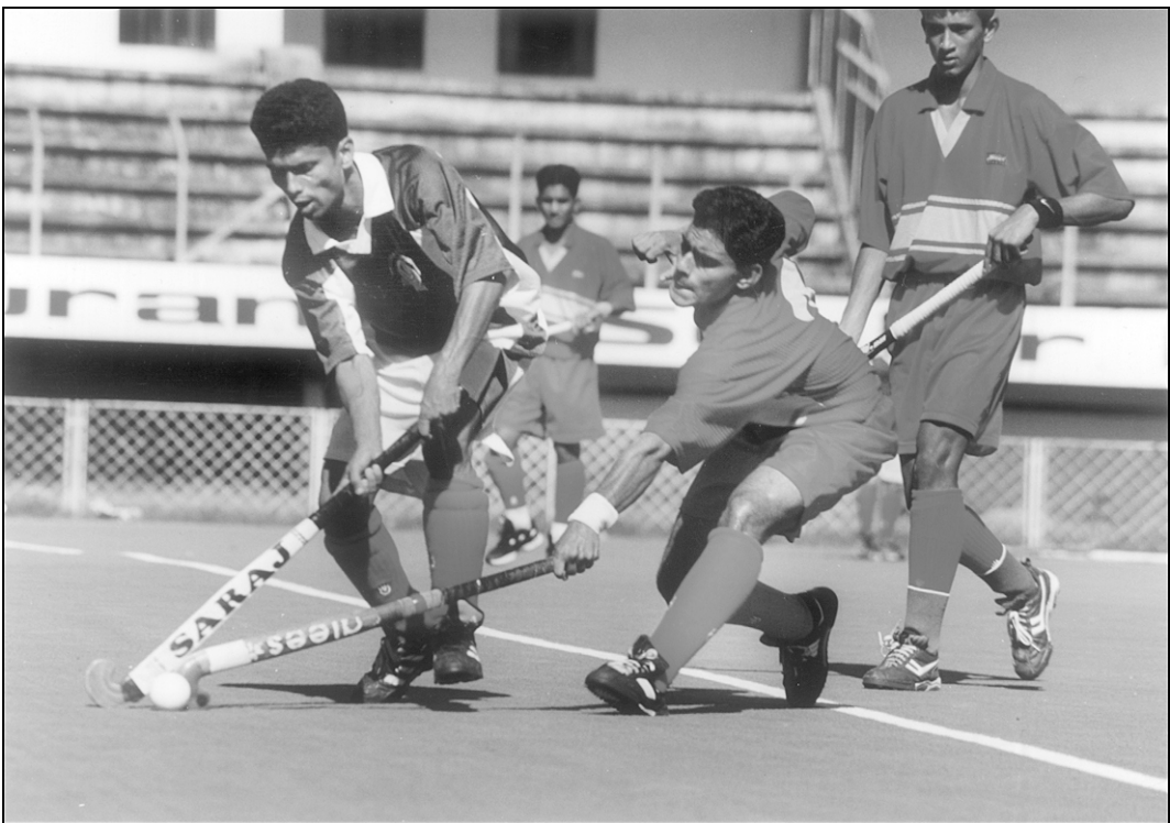
Action from yesterday's First Division hockey Super League match between Azad Sporting Club and Victoria Sporting Club at the Maulana Bhasani National Stadium.