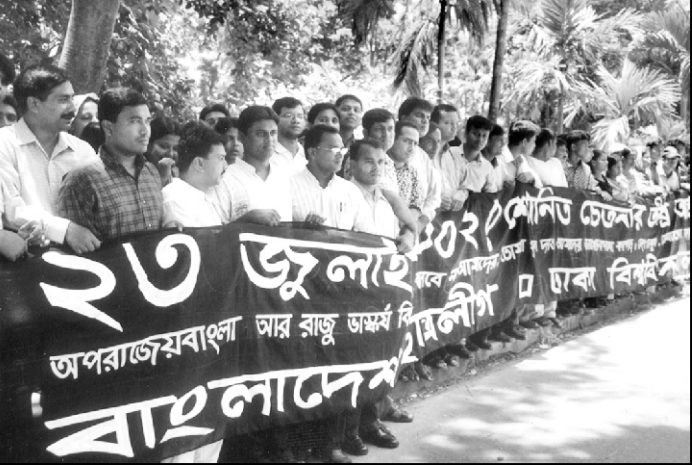
Bangladesh Chhatra League formed a human chain on the Dhaka University campus yesterday to commemorate the police atrocities on female students of Shamsunnahar Hall.