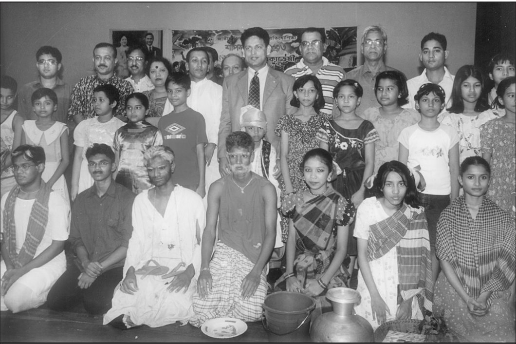
Participants of Jatiya Zia Shishu Shilpi Competition - Shapla Kuri 2003 pose with State Minister for Education ANM Ehsanul Haq Milon and the judges at the Shishu Academy yesterday. The Zia Shishu Academy organised the competition.