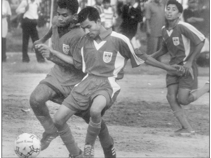
Scene from the schools football match between Enayet Hossain Model High School and South Banashree Model High School at the outer stadium yesterday.

TODAY'S MATCH Bangladesh SC vs Dhaka Railway (4:15pm)