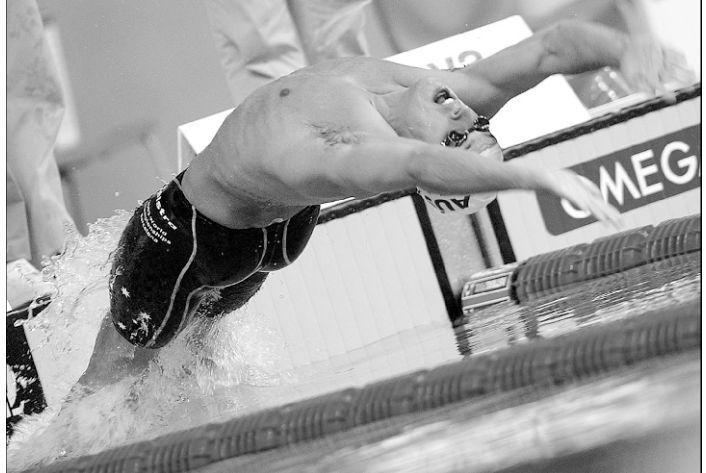
Australia's Matthew Welsh dives on way to win 50m butterfly gold at the 10th FINA Swimming World Championships on Monday.

The American took two years off after the Sydney Olympics where she won three gold medals to begin medical studies at Columbia University, and is testing herself for next year's Athens Olympics.