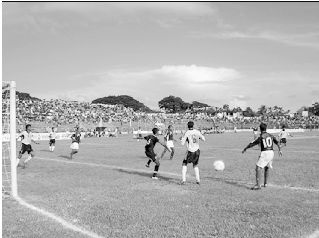
A goalmouth action during the Nitol-Tata National Football League clash between Moulvibazar Wanderers and Jhenidah Mohammedan at the Sylhet Stadium yesterday.

The super-league teams are: Azad SC, Dhaka Wanderers Club, Shishu Kishore SC and Victoria SC.