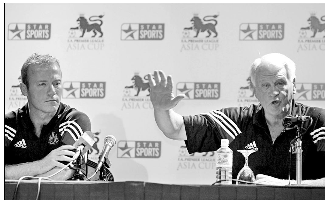
Newcastle captain Alan Shearer (L) looks on while manager Sir Bobby Robson speaks during a press conference after arriving in Kuala Lumpur yesterday.

Chelsea is due to land in Kuala Lumpur on Tuesday morning and have their first training run later in the day.