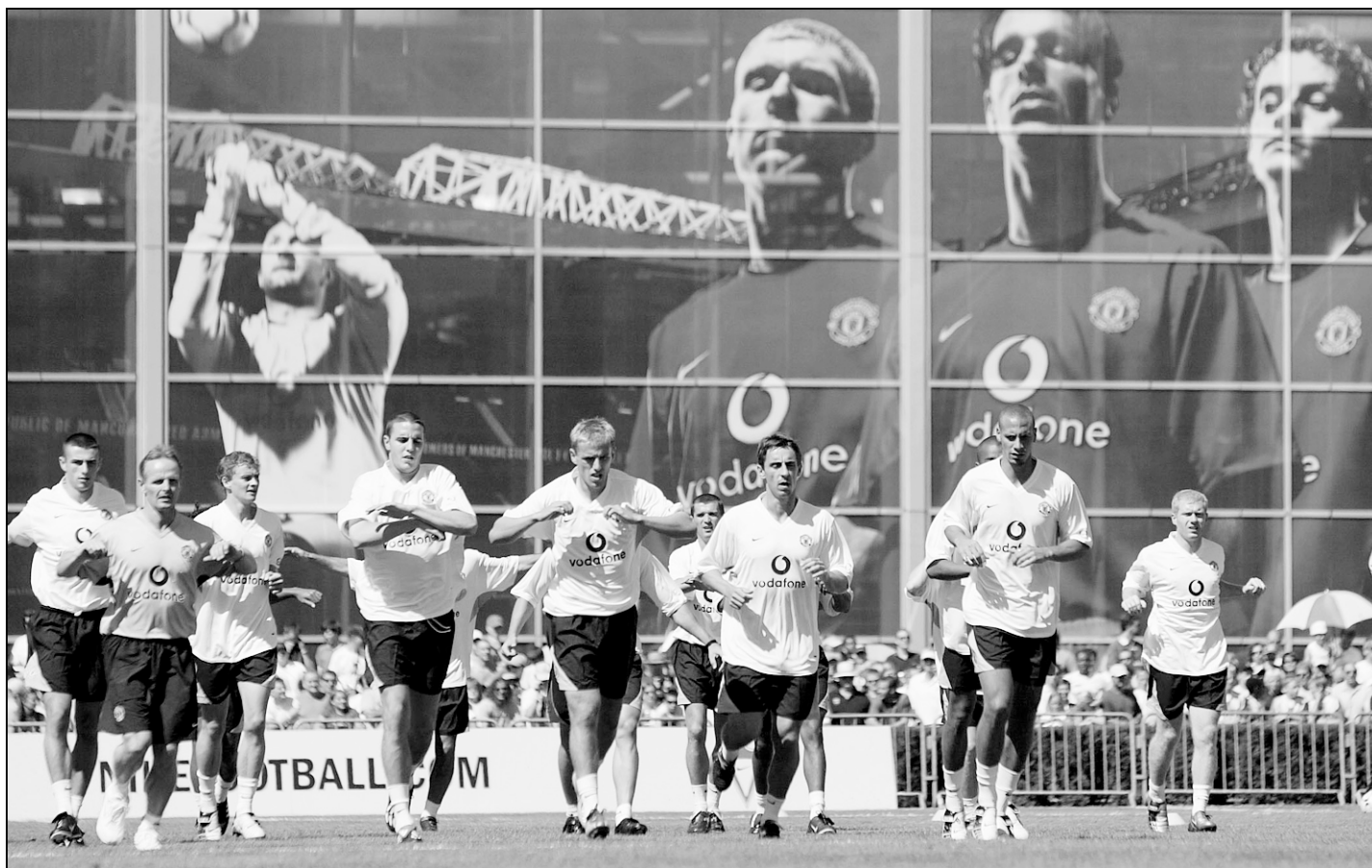
The Manchester United squad jog in front of a massive promotional poster at the Nike Training Facility in Portland, Oregon on July 20.

"There were rules last year and there are rules now. It's consequently worth reminding our players that they must not express opinions on the club, seeing as this matter is not their responsibility."