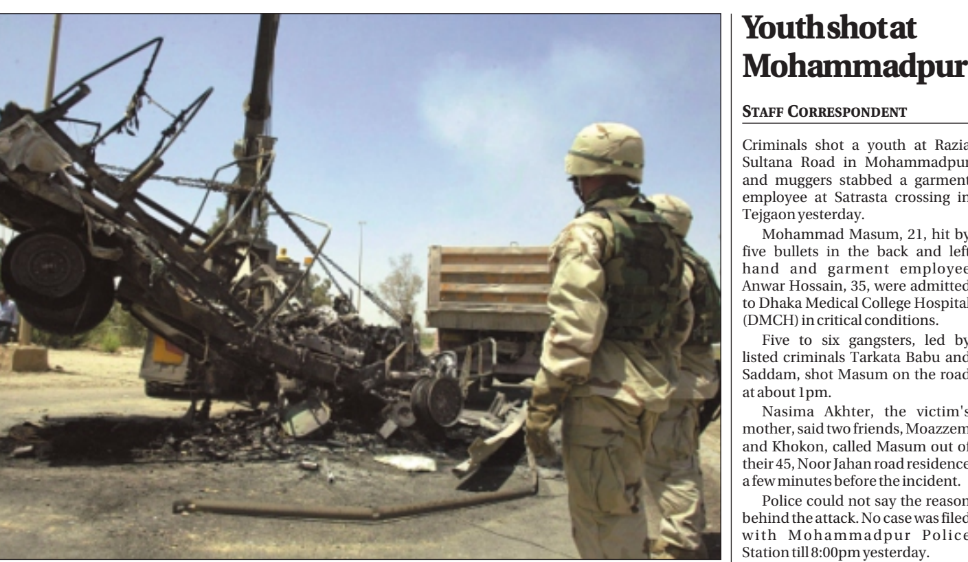
US soldiers watch as the charred shell of an army vehicle is removed from the scene where one of their colleagues and an Iraqi translator were killed yesterday.

Despite intensive search in various parts of the city, police have so far failed to arrest the others linked to the mayhem.