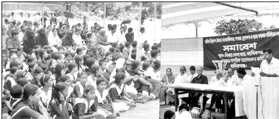
Oikyabaddha Nagorik Andolon (united movement of citizens) organised a rally at the outer stadium at Manikganj town on Sunday protesting price hike of essentials and violence against women.