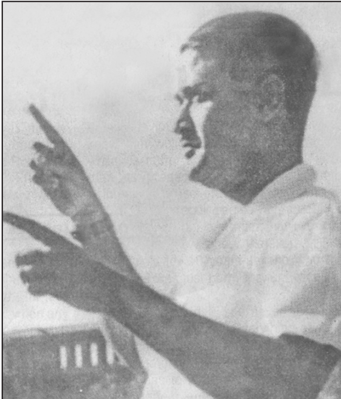
Comparable only to himself. His tunes continue to mesmerise listeners.

My gloriously successful father left us all forever, on the 20th of July 1974 at the P.G. Hospital in Dhaka. We had moved to Dhaka from Kolkata in 1967. But the small horizon of Dhaka's music and the government of the time made the giant feel caged. After the independence of Bangladesh, my father was given the citizenship of Bangladesh and was later offered the position of Chief Music Director of the Transcription Service of Ban-