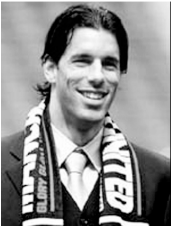
RUUD VAN NISTELROOY

He also told United's television station MUTV: "It was great to play with David. I will miss him and I