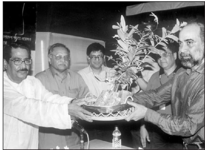
Environment Minister Shahjahan Siraj distributes saplings at the BATB's free sapling distribution programme yesterday.