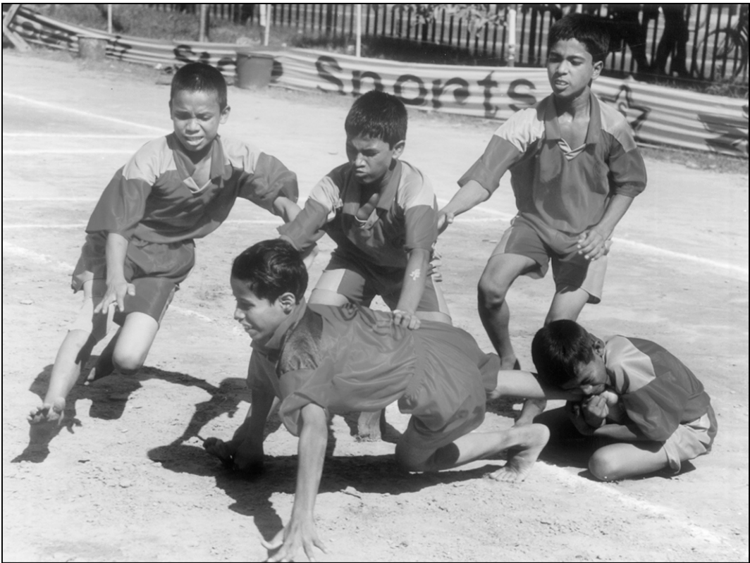
Scene from the schools kabadi match between Bhasantek High and Islamia High at the outer stadium yesterday.

King, whose hard-line stance on the coaching issue led to Capriati's dismissal from a 2001 Fed Cup squad, allowed eighth-ranked Chanda Rubin and 18th-rated Meghann Shaughnessy to have their coaches attend workouts.