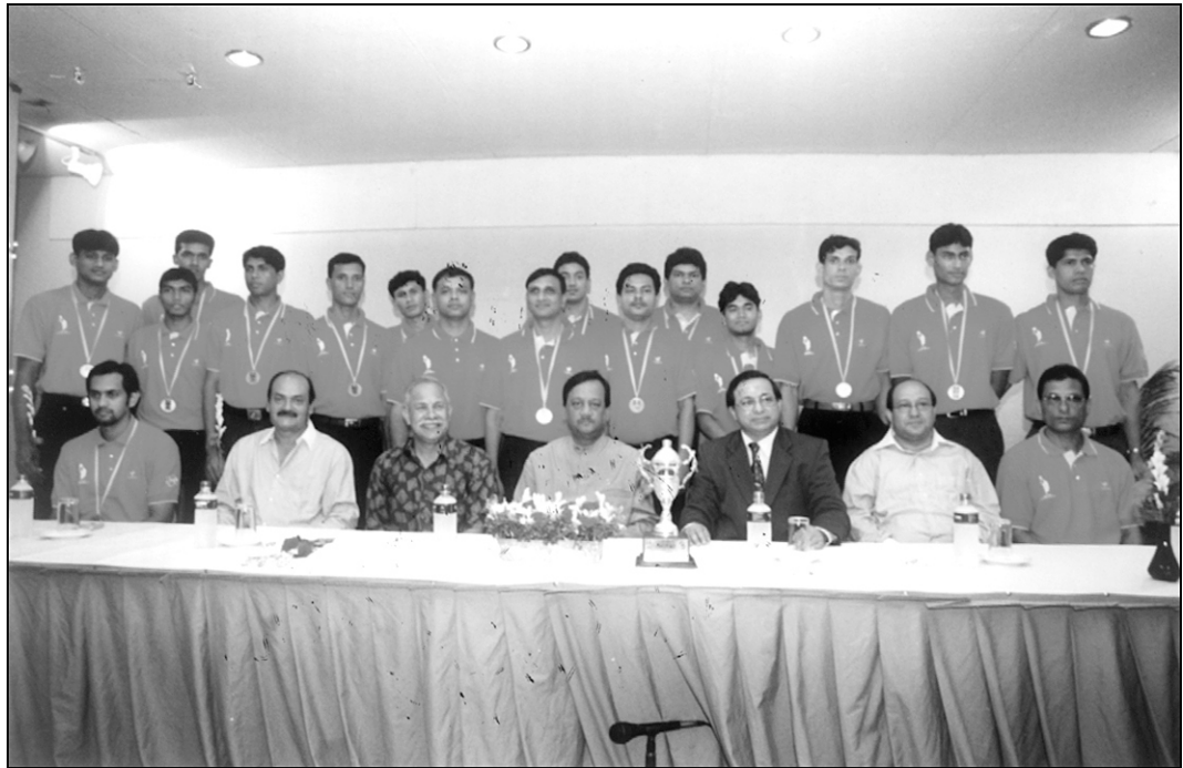
The Bangladesh basketball team was accorded a reception yesterday for their achievement in the Asian Basketball Confederation qualifying tournament in New Delhi recently.

"Definitely (there's) a pride," he said.