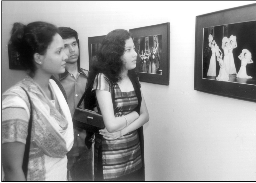
Visitors at the photography exhibition of A B M Salahuddin at the Shilpakala Academy yesterday. Bangladesh Shilpakala Academy and Embassy of Vietnam organised the weeklong exhibition.

The DoE was now encouraging the people to use environment-friendly block bricks, manufactured by computerised machines in the country.