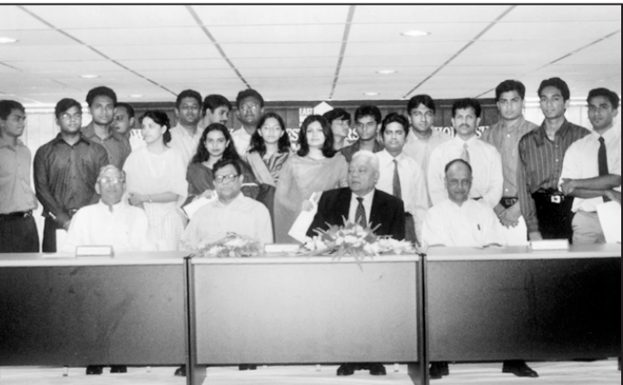
Recipients of Merit Scholarship Awards of East West University pose with the guests at the award ceremony held on its campus yesterday.