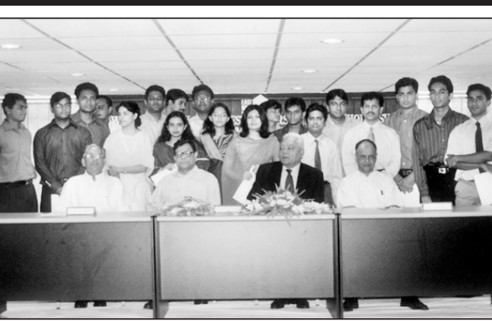
Recipients of Merit Scholarship Awards of East West University pose with the guests at the award ceremony held on its campus yesterday.