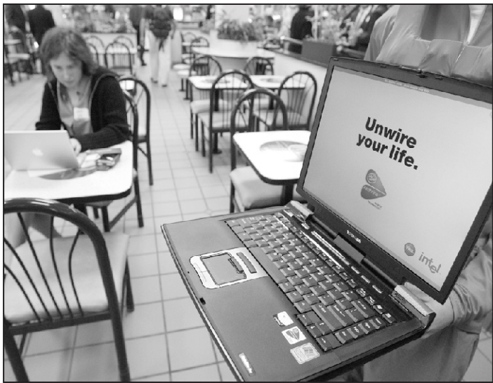
An unidentified man holds a laptop with a wireless Internet connection at a McDonald's restaurant on July 8, in San Francisco, California. Many McDonald's restaurants around the San Francisco Bay Area will be providing a fee based high-speed wireless access for people using wireless-enabled notebook computers and handheld devices.