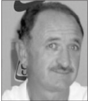
LUIZ FELIPE SCOLARI

But Scolari warned against those critics who were writing off the South Americans.