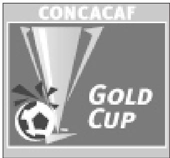
AP, Mexico City

Brazil, who outplayed Mexico in their first CONCACAF Gold Cup match but still lost, find themselves in a must-win situation against a confident Honduras.