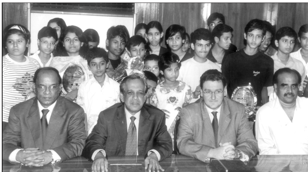
Participants of the Standard Chartered bank school chess tournament pose with the guests after the end of the meet at the NSC yesterday.