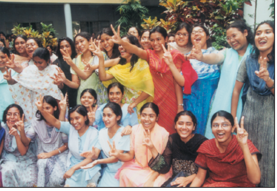
Motijheel Ideal School students (L) and Vigarunnisa Noon School students (R), who have secured A+ in SSC examination, show victory sign. Results of the examination were published yesterday.