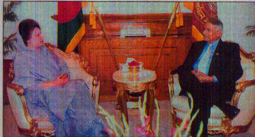
Visiting Indian External Affairs Minister Yashwant Sinha, right, meets Prime Minister Khaleda Zia at the Prime Minister's Office yesterday.