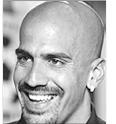
JUAN SEBASTIAN VERON

Veron's fee was then a British record of £28.1m, and despite repeated criticism of the deal