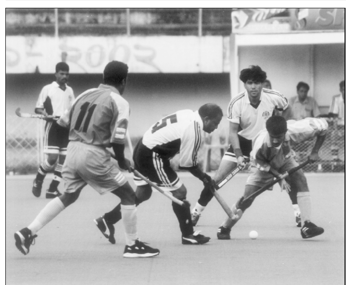
A midfield action from yesterday's Green Delta First Division Hockey League between Dhaka Wanderers Club and Farashganj Division Club at the Maulana Bhasani National Stadium.

He has long described India as the "final frontier" for the Australian team to conquer, and swore after Australia's defeat in 2001 that he would be back to set the record straight.