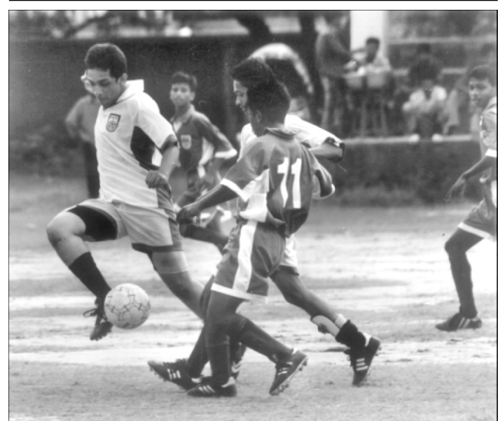
Action from yesterday's Dhaka Metropolis inter-school football competition match between Rahmatullah Model High School and Udayan High School at the Dhaka University ground.