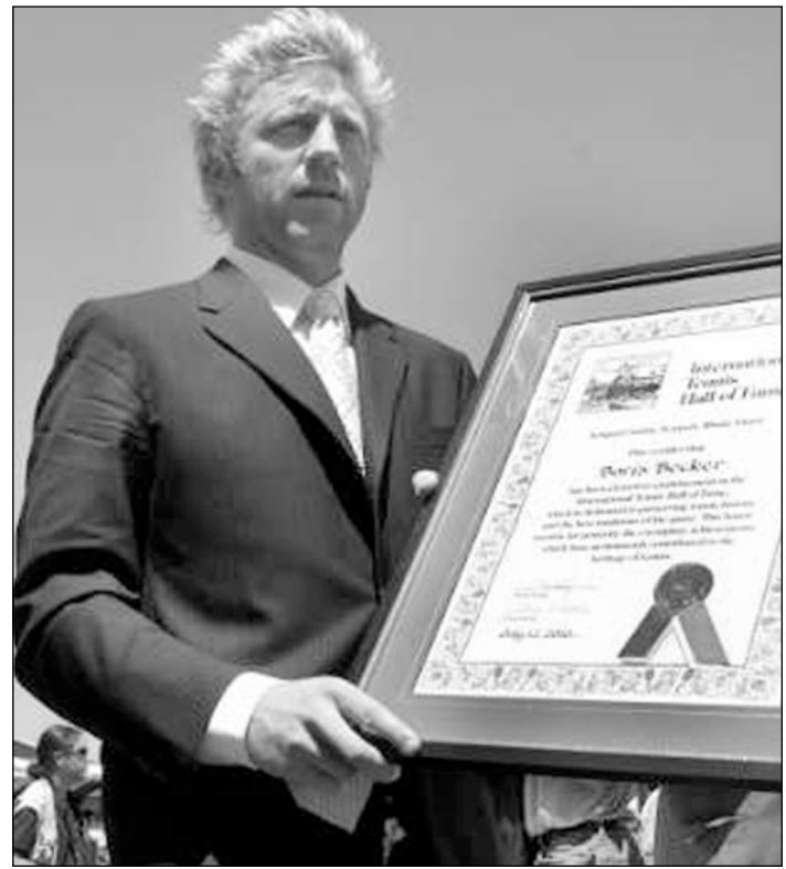
German tennis legend Boris Becker holds up his plaque after being inducted into the International Tennis Hall of Fame, during a ceremony in Newport, Rhode Island on July 12.