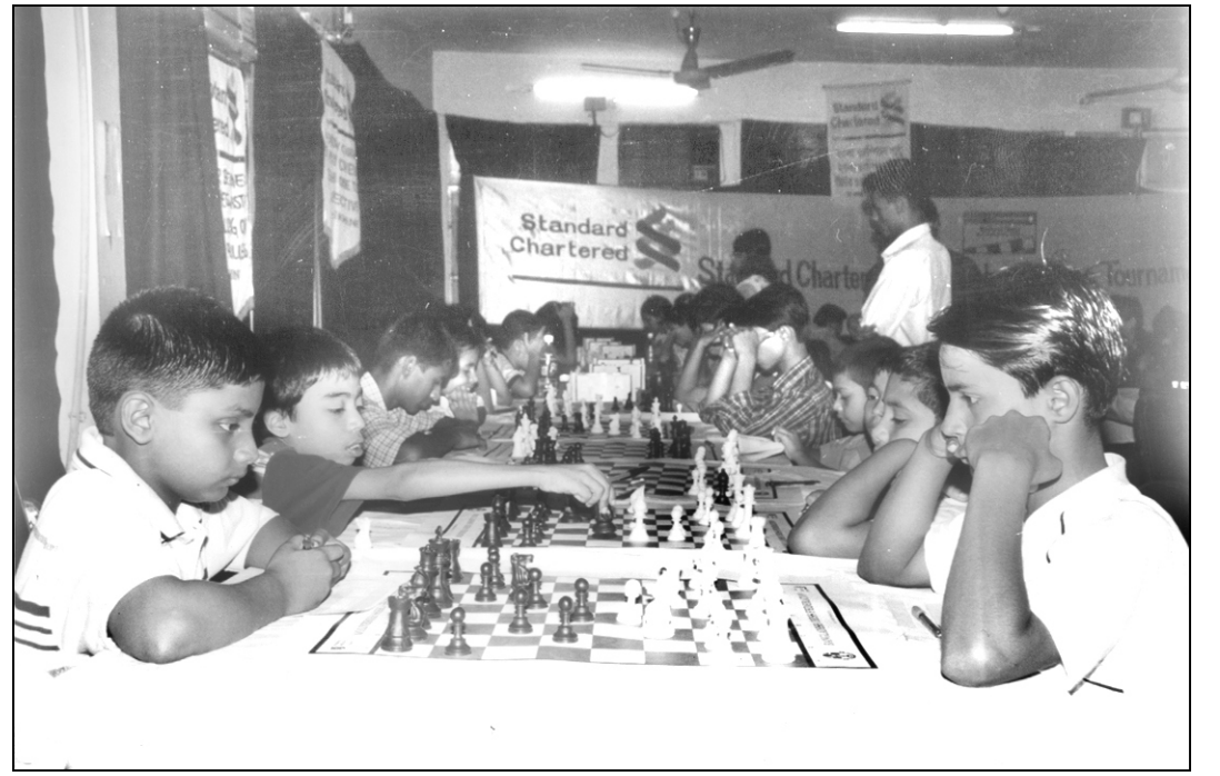
Scene from yesterday's seventh round engagements of the Standard Chartered bank school chess tournament at the NSC.

Noor Mohammad defeated Bagbari Govt Primary School 63-35, Alhaj Jafar Bepari smashed Khilgaon Govt Staff School 55-21 and Bhasantek High School beat Haider Ali High School 38-29.